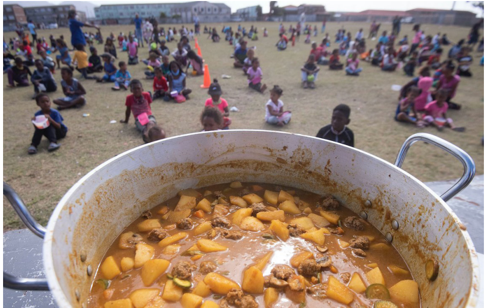
Children wait for food during Covid-19 lockdown

The Unemployed People's Movement (UPM) advocates for change for the jobless, addresses food sovereignty and the climate crisis affecting the poor. In January UPM won an unprecedented case dissolving the Makana Local Municipality after years of not meeting the basic needs of residents due to corruption. UPM continues to challenge issues of unemployment, poor-quality housing, lack of water and sanitation, lack of electricity and street lighting, and violence against women.