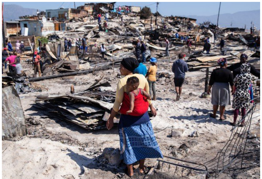
Informal Settlement fires

Artist Proof Studio (APS) , Johannesburg, South Africa