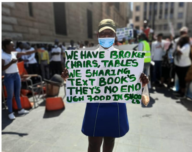
School Budget Cut Protest Equal Education