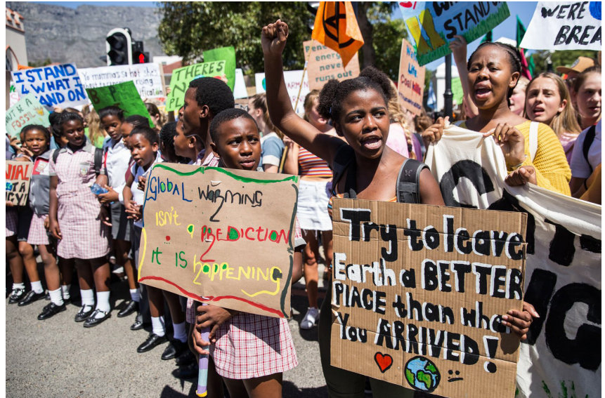
Youth climate protest

The Social Justice Coalition (SJC) is a membership-based social movement rooted in the informal settlements around Cape Town. SJC's campaigns are based on research, education, and advocacy. Organizing for the rights of informal settlement residents to dignity, equality, and justice and working to ensure all people have access to a democratic and effective police and criminal justice system. www.sjc.org.za