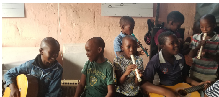
Music instruction and practice Khayelitsha Music Academy