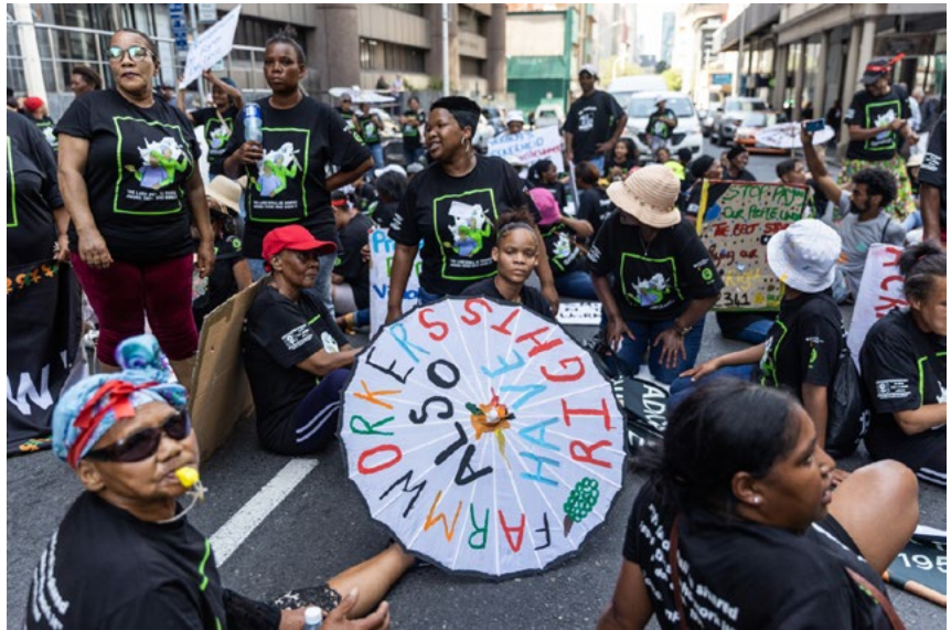
Women on Farms march to Parliament demanding changes to land distribution and a moratorium on evictions from farms.

The Trust for Community Outreach and Education (TCOE) works with farm workers and farm dwellers aimed at overcoming grinding poverty, evictions and other labor and human rights abuses that take place on the farms. Working in collaboration with a small independent farm workers' union – the Commercial Stevedores, Agriculture and Allied Workers Union (CSAAWU), to build self-organization and agency; raising of awareness of socio-economic-labor rights and the establishment of a Rural Legal Centre in Nkqubela/Robertson that services between 60 -100 people per week. tcoesa.org