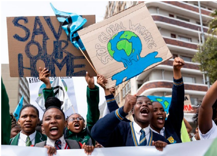
Young people, marched to Parliament calling for policies to reduce climate change on Heritage Day

The Unemployed People's Movement (UPM) advocates for change for the jobless, addresses food sovereignty and the climate crisis affecting the poor. In 2021, UPM won an unprecedented case dissolving the Makana Local Municipality after years of not meeting the basic needs of residents due to corruption. UPM continues to challenge issues of unemployment, poor-quality housing, lack of water and sanitation, lack of electricity and street lighting, and violence against women.