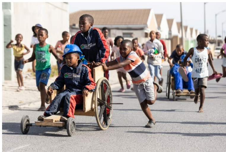
Children race go-karts in Gugulethu township in Cape Town.

Artist Proof Studio (APS) is a community-based printmaking center, founded on a sense of shared humanity whereby people of talent and passion can reach for excellence in art making to achieve self-sustainability. APS provides an environment to develop citizens with a common set of values, expressed in the notion of Ubuntu, that have talent and passion to achieve artistic excellence. APS focuses on printmaking and its allied outreach programs to build capacity of people to reach self-actualization and make a difference in society. artistproofstudio.co.za