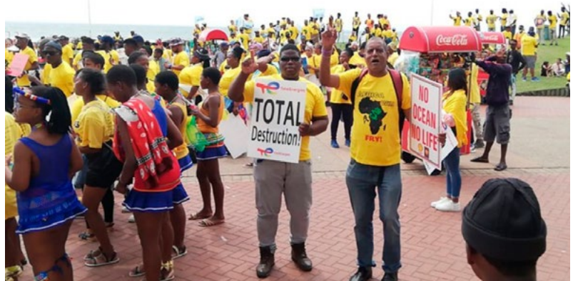
South Durban Community Environmental Alliance calls for more action from the state to mitigate climate change in a demonstration against oil and gas exploration along South Africa's eastern coastline .

South Durban Community Environmental Alliance (SDCEA) is an environmental justice organization, made up of 19 affiliate organizations. Since 1995, SDCEA has been organizing, reporting and researching industrial incidents and accidents by oil refineries, paper mills and other toxic industries in Durban. SDCEA advocates for legislation and measures that prevent pollution and ecological degradation, supports the community as it continuously struggles for clean air, water and soil and for the alleviation of environmental racism and poverty. In 2022, SDCEA responded to the devastating floods in eThekweni Municipality. sdcea.co.za