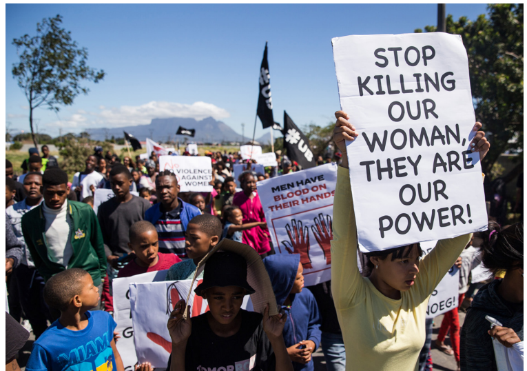
Residents from Elsies River in Cape Town march against gender-based violence.