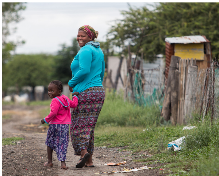
Marikana mine workers live in dire conditions 3 years after the Farlam report; 1 in 5 Lonmin employees stay in decent housing.

Equal Education Law Centre (EELC) is a law clinic that engages in public interest litigation and advocacy relating to education in South Africa. It was established to support progressive community-based action to improve South Africa's education system which remains characterized by poor quality and impacts most severely on historically disadvantaged communities. www.eelawcentre.org.za