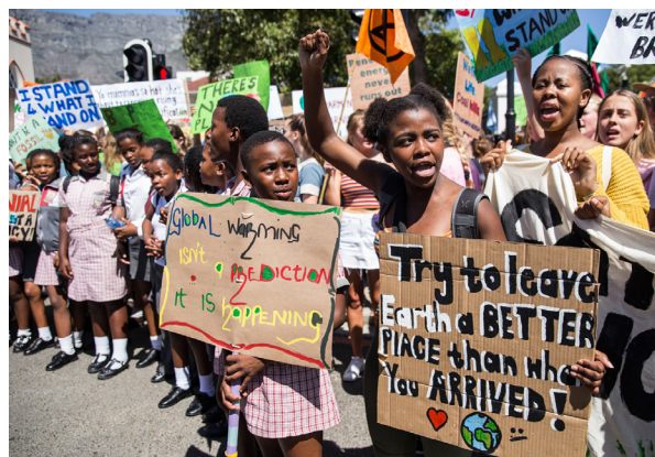
Youths protest for action against climate change outside Parliament.

The South Africa Development Fund (SADF) is a U.S. tax-exempt public charity. Established in 1985 by political exiles, SADF provides grants to community-based organizations committed to non-sexist, non-racial, democratic practices which address human rights through health, education, economic development, environmental justice and democracy-building. SADF seeks to use philanthropy to promote grassroots activism aimed at providing services and resources to communities disadvantaged by decades of apartheid policies. Since its inception, the organization has facilitated cooperation between concerned Americans and South Africans to enhance social and economic justice in South Africa.