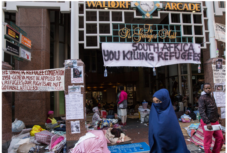
Refugees Camp Outside the UNHCR, Photo by Ashraf Hendricks, GroundUp

Section27 is a public interest law center that seeks to achieve substantive equality and social justice in South Africa. Section27 uses law, advocacy, legal literacy, research and community mobilization to achieve access to healthcare services and basic education. Section27 aims to achieve structural change and accountability to ensure the dignity and equality of everyone. www.section27.co.za