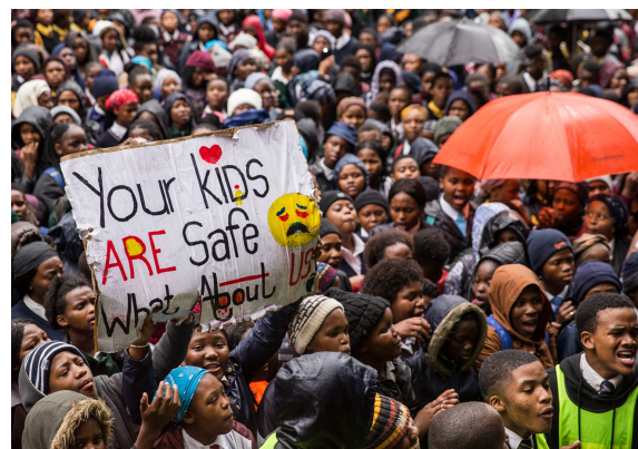
Learners demand school safety

Equal Education (EE) is a social movement led by students, educators and activists to address inequality in the South African