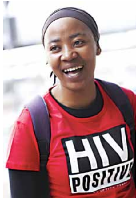
Treatment Action Campaign

In Cape Town, more than 400,000 people are currently on the waiting list for housing. The WCAEC believes this backlog to be a product of the government's ongoing neglect of the rights of poor people to housing and other basic services. WCAEC maintains that current municipal practices based on class and political affiliation make it easier for government officials to implement policies that neglect the needs of the poorest citizens.